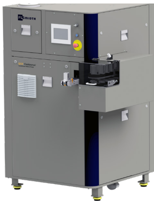
Stand-alone with Cup/Ring magazine